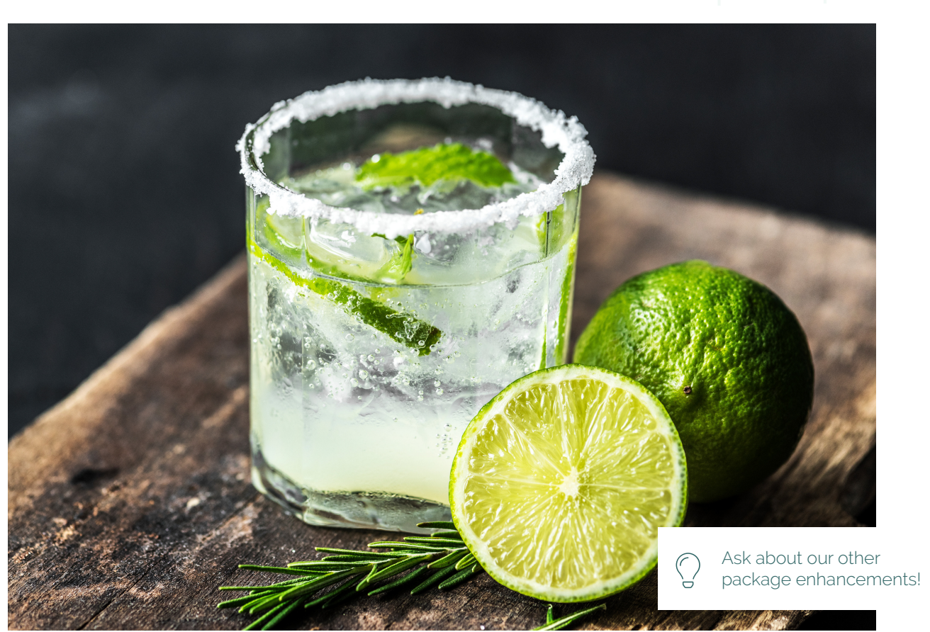
All per person prices plus applicable venue rental fee are subject to 22% administrative fee & sales tax.